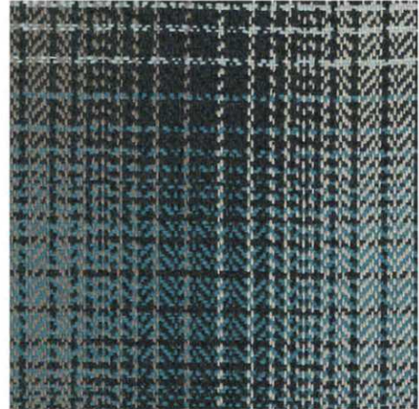
Willoughby - Imperial Grade 2