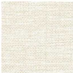
Veejay - Beeswax Grade 3