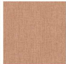
Vault - Terra Cotta Grade 4