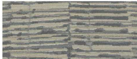
Jezebel - Strata* Grade 5