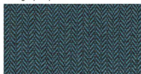
Walker - Imperial Grade 2