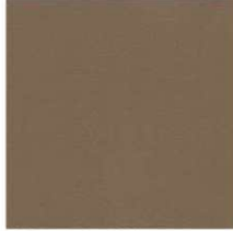
Valuable - Silt Grade 1