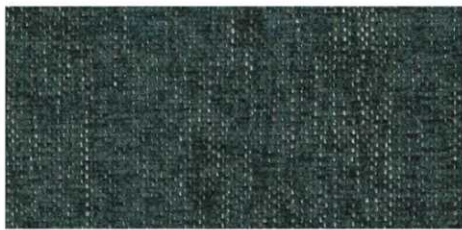
Wayward - Tranquil Teal Grade 3