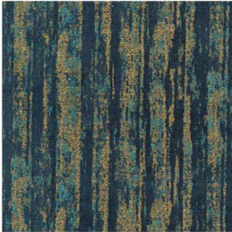
Reptile - Verdigris * Grade 4