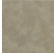
Volcano - Stone Grade 2