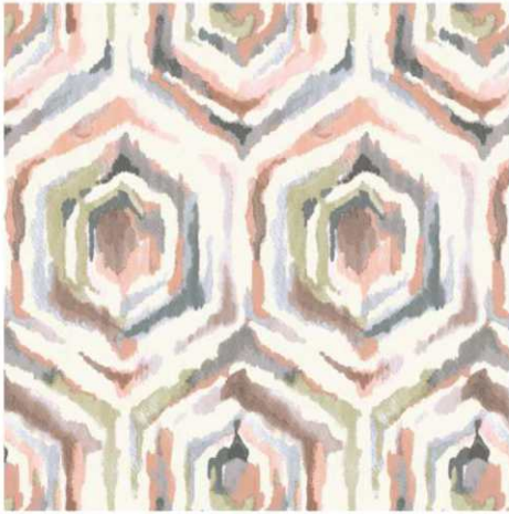
Contessa - Blossom on Serenade Grade 2