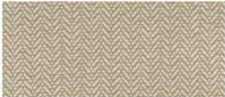
Walker - Burlap Grade 2