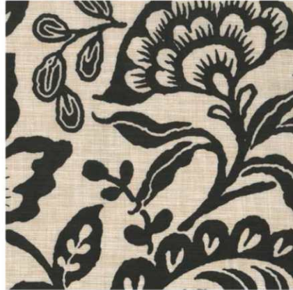
Jordan - Noir on Serenade Grade 2