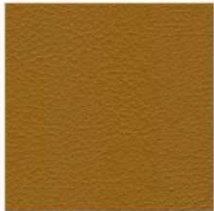
Vaggio - Butterscotch Grade 2