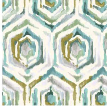
Confessa - Pool Party on Serenade Grade 2