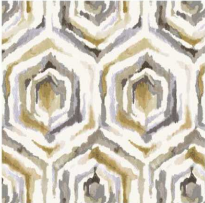
Contessa-Mineral on Serenade Grade 2