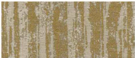
Reptile - Fawn* Grade 4