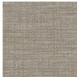
Veejay - Fawn Grade 3