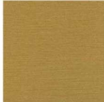
Vapor - Anjou Pear Grade 3