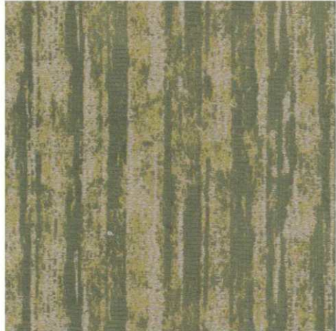
Reptile - Moss* Grade 4