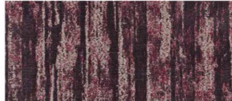
Reptile - Purple Rain* Grade 4