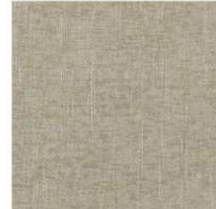
Wayward - Natural Grade 3