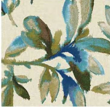
Avalon- Seaside on Serenade Grade 2