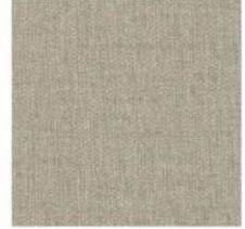
Vizor - Bisque Grade 2