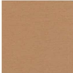
Vapor - Ginger Grade 3