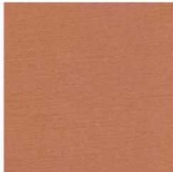
Vapor - Terra Cotta Grade 3