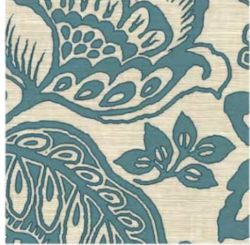
Jordan - Aegean on Serenade Grade 2