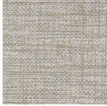
Veejay - Mineral Grade 3